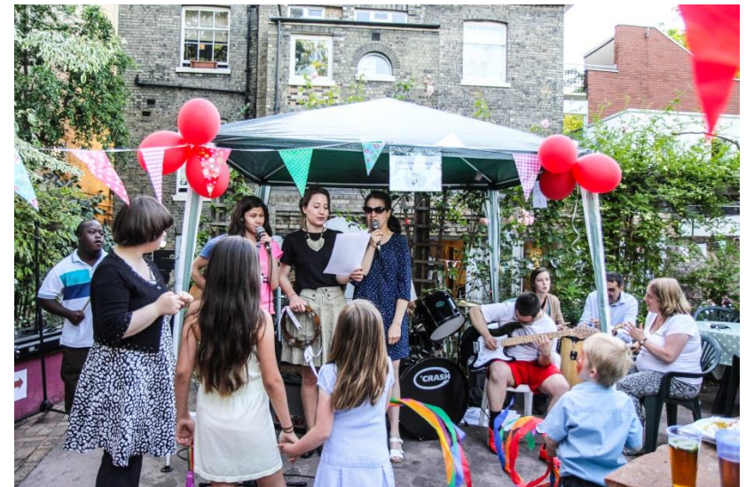
Service users perform with their band 'The 404 Stormers' at our Annual Summer Garden Party