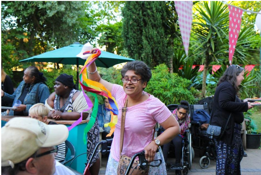
Centre 404 Annual Summer Garden Party

Start your career in social care at Centre 404!