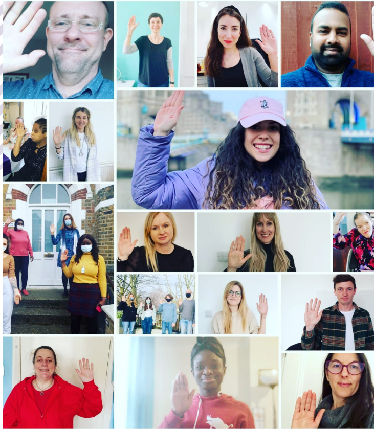
Staff and service users taking part in International Women's Day

Centre 404 regularly receives positive feedback from our service users and/or their family carers that our presence is reassuring and that we provide a solid foundation and back drop to their lives. A huge part of this is the staff and volunteers who continue to work at Centre 404 and stay with us over a number of years 5 years, 10 years and longer. The importance of this consistency and dedication to our service users cannot be underestimated. We are proud to have a lower staff turnover than generally within the sector and will continue to work with staff and volunteers to understand how we can continue to make Centre 404 a great place to work.