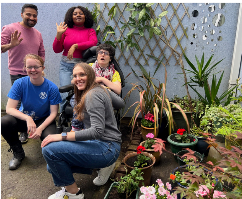
Centre 404 in bloom

A number of new appointments have continued to add to the skills and experience of our Trustees and Senior Management Team. You can find out more on the following pages.