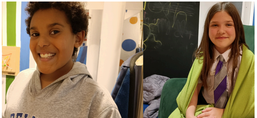
Service users from Young Carer's Group

A heartfelt thanks to all our supporters, staff and volunteers who donated and attended our events, especially to the People's Army, and our long-term monthly donors for contributions.