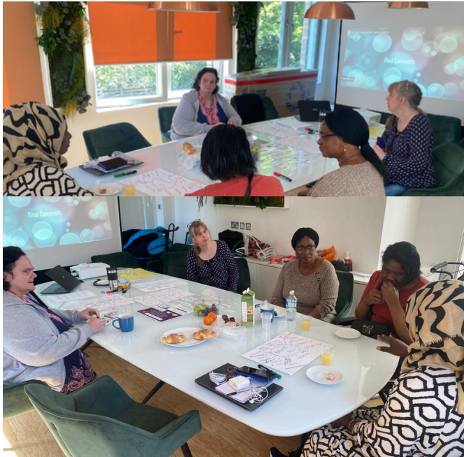
'Love and Loss Café' with service users