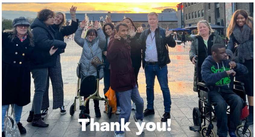
Service users from Happy Tuesday