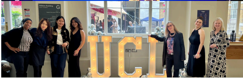
Ceremony at Bloomsbury Theater, UCL